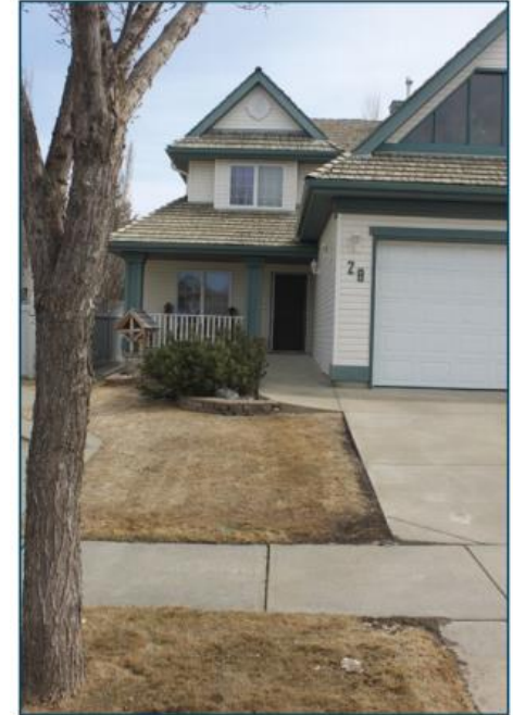
Figure 1: Visitable home complete with a no-step front entrance