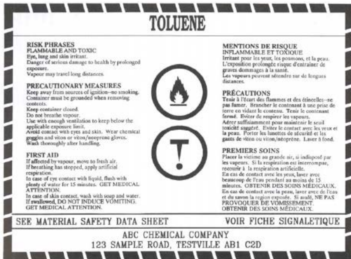
Figure 2 Example of a WHMIS supplier label